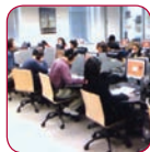
• In classroom