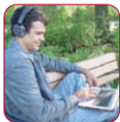
• Virtual (24/7)